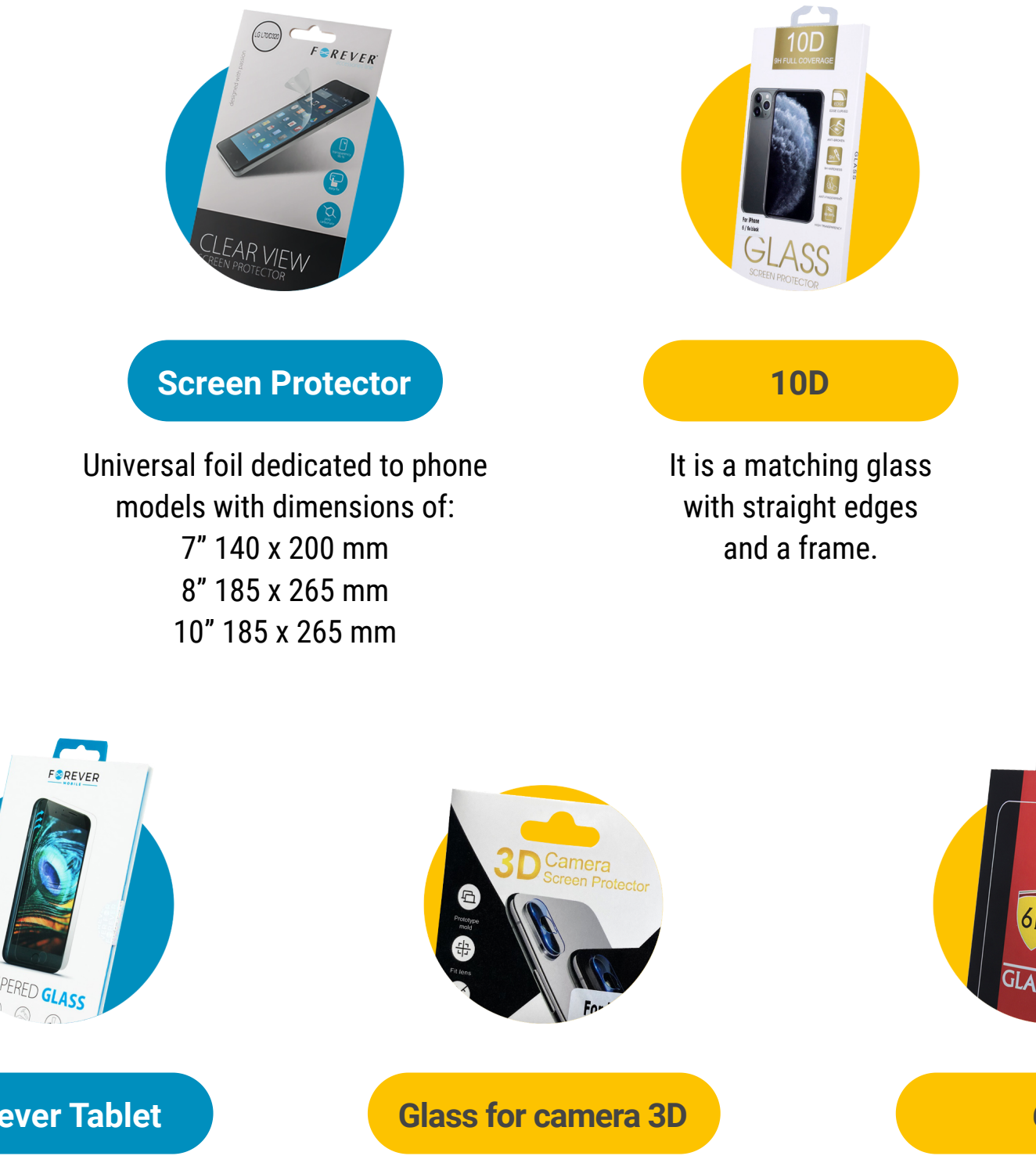
Glass dedicated to specific tablet models.